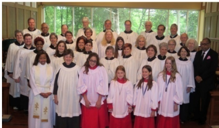
Sunday, November 3, 2019, 5:30 p.m. All Saints' Evensong, Coventry Choir