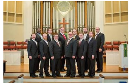
Sunday, December 8, 2019, 4:00 p.m. Beale Canto