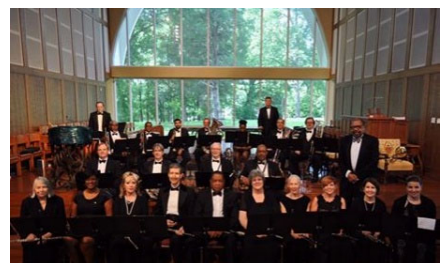
Sunday, June 7, 2020, 2:00 p.m. Sanctifica Concert